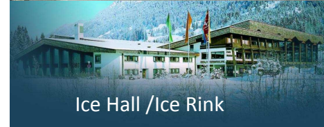
Ice Hall /Ice Rink