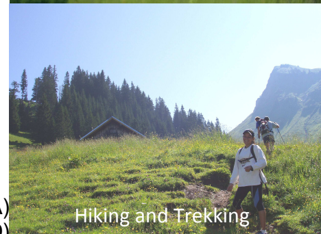
Hiking and Trekking